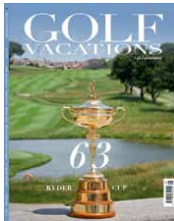
GOLF VACATIONS Issue 63