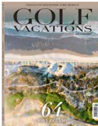
GOLF VACATIONS Issue 64