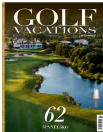
GOLF VACATIONS Issue 62