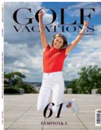
GOLF VACATIONS Issue 61