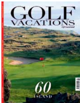
GOLF VACATIONS Issue 60