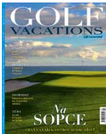
GOLF VACATIONS Issue 58